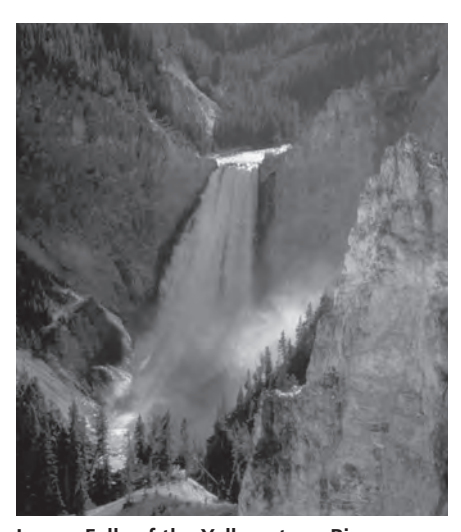
Lower Falls of the Yellowstone River

The spectacular Grand Canyon of the Yellowstone, including Upper and Lower Falls of the Yellowstone River, can be seen from the overlooks and trails of the Canyon Village area, and from the Tower Fall and Calcite Springs overlooks south of Tower Junction.