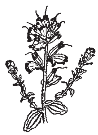
Seaside Painted Cup