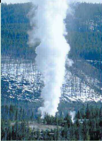
Steamboat Geyser in steam phase, 9 AM, May 2, 2000