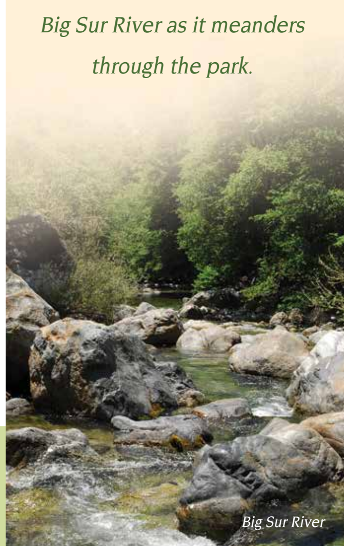
Big Sur River

P feiffer Big Sur State Park is loved for the serenity of its forests and the pristine, fragile beauty of the Big Sur River as it meanders through the park.