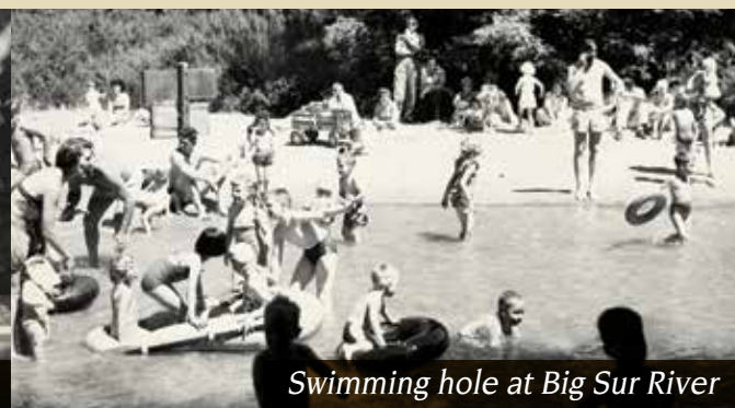
Swimming hole at Big Sur River