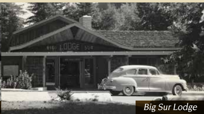
Big Sur Lodge