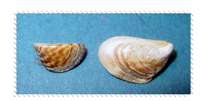
Zebra Mussel, left; Quagga Mussel, right.

For more information: http://100thmeridian.org