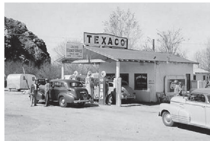
Postcard photograph by Merle Porter of Jack's Texaco Service Station and Trailer Camp in Barstow, California, postmarked 1949.

Route 66 provided some relief to communities located along the highway during the Great Depression. It passed through numerous small towns and, with the growing traffic on the highway, helped create the rise of mom-and-pop businesses, such as service stations, restaurants, hotels, motels and motor courts.