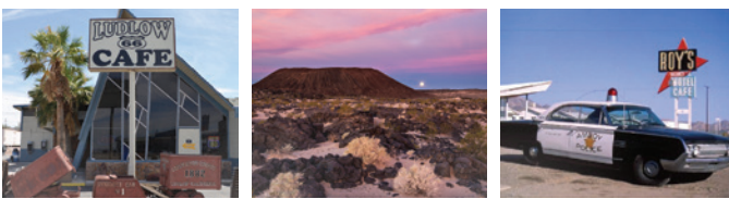
7 Ludlow Café 8 Amboy Crater National Natural Landmark 9 Roy's Café