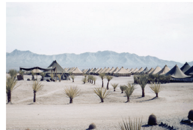
World War II Desert Training Center, California-Arizona Maneuver Area.

During World War II, the fully paved highway was one of the main roads used to move equipment, troops, and supplies to support military training operations for the Desert Training Center and other war-related industries in California.