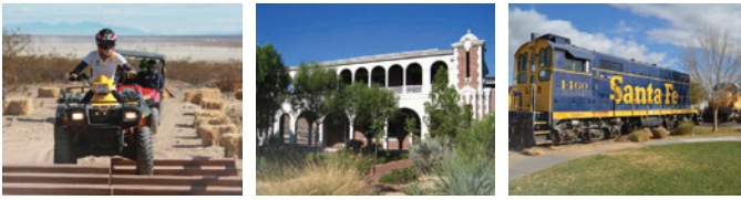
1 El Mirage Dry Lake Recreation Area 2 Casa Del Desierto Harvey House 3 Western America Railroad Museum

Experience the vastness of the Mojave Desert, and discover the iconic signs, buildings and communities that have ignited the romance of Route 66 for generations.