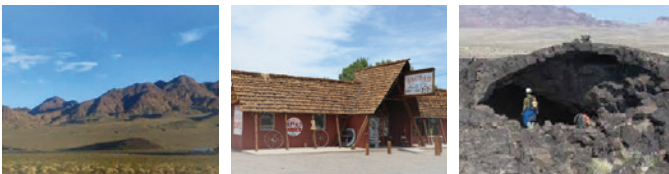
4 Newberry Mountains Wilderness 5 Bagdad Café 6 Pisgah Crater and Lava Tube