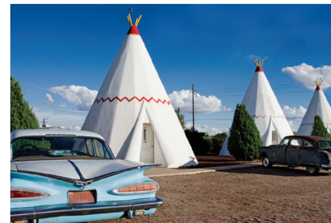
Wigwam Motel, Route 66, Holbrook, Arizona. Carol M. Highsmith's America, Library of Congress, Prints and Photographs Division.

During World War II, the fully paved highway was one of the main roads used to move equipment, troops, and supplies to support military training operations for the Desert Training Center and other war-related industries in California.