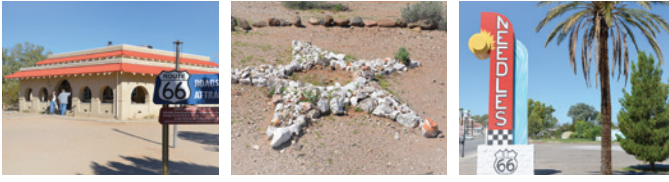
13 Goffs Schoolhouse 14 Camp Ibis, WWII Desert Training Center 15 Needles Town Square