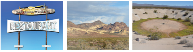
10 Road Runner Retreat 11 Clipper Mountain Wilderness 12 Camp Essex, WWII Desert Training Center