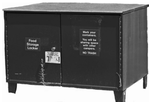
Food storage locker 3 ft x 4 ft x 3 ft

Rocky is renowned for its wildlife. Help protect them by not attracting wildlife, including black bears, to your campsite due to improperly stored food. Bears can visit any time of day.