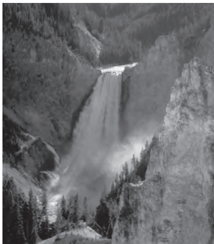
Lower Falls of the Yellowstone River

The spectacular Grand Canyon of the Yellowstone, including Upper and Lower Falls of the Yellowstone River, can be seen from the overlooks and trails of the Canyon Village area, and from the Tower Fall and Calcite Springs overlooks south of Tower Junction.