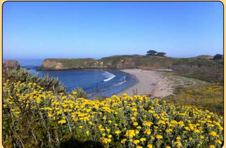
Andrew Molera State Park, Big Sur Rivermouth