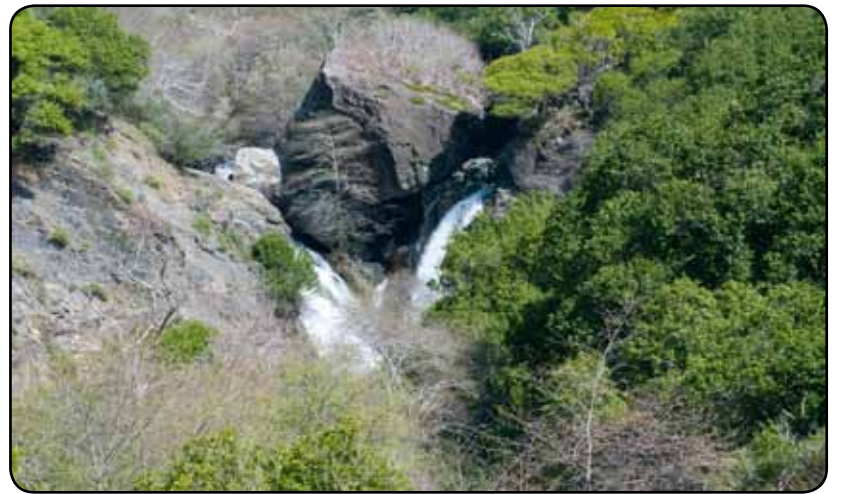
Salmon Creek Falls