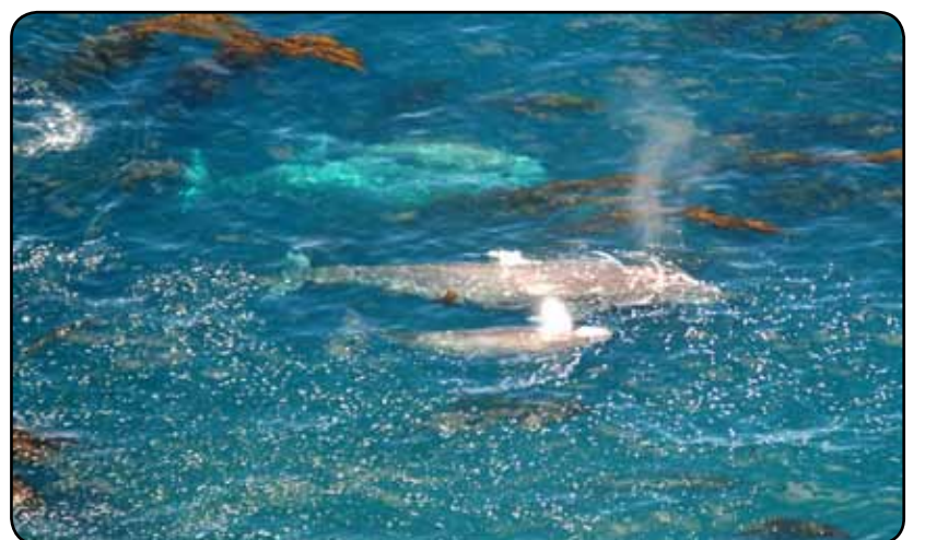
Gray whales migrating along the Big Sur coastline