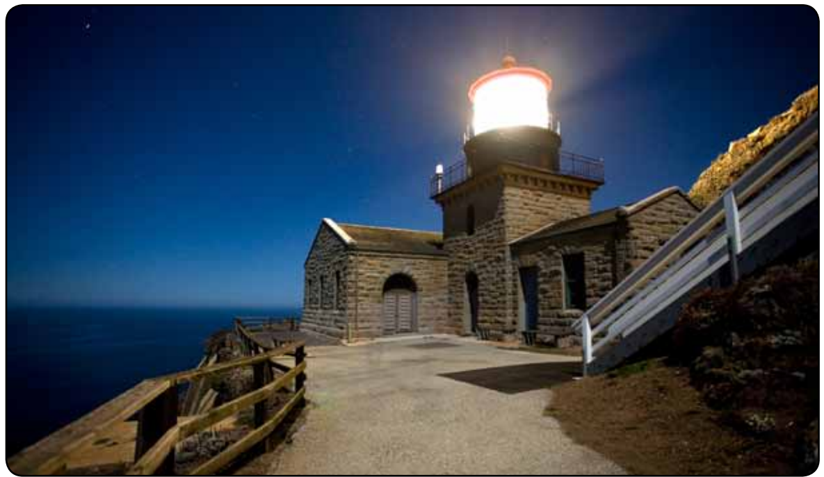
Point Sur Light Station

For information regarding guided tours, check the interpretive notices posted in the state parks. Trained volunteer docents provide an informative and pleasurable tour to the visiting public, and provide access to the Point Sur Lightstation. Visit us on the web at www.pointsur.org