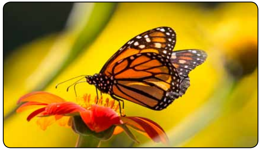
Monarch butterflies migrate to Big Sur annually.

Evenings offer the opportunity to dine in restaurants from fanciful to exquisite. Relax in lodging that ranges from rustic to ultra-luxurious. Camp out in the many well equipped campgrounds. Luxuriate at health spas. And of course, one of the favorite ways to pass the time in Big Sur is to simply Do Nothing .