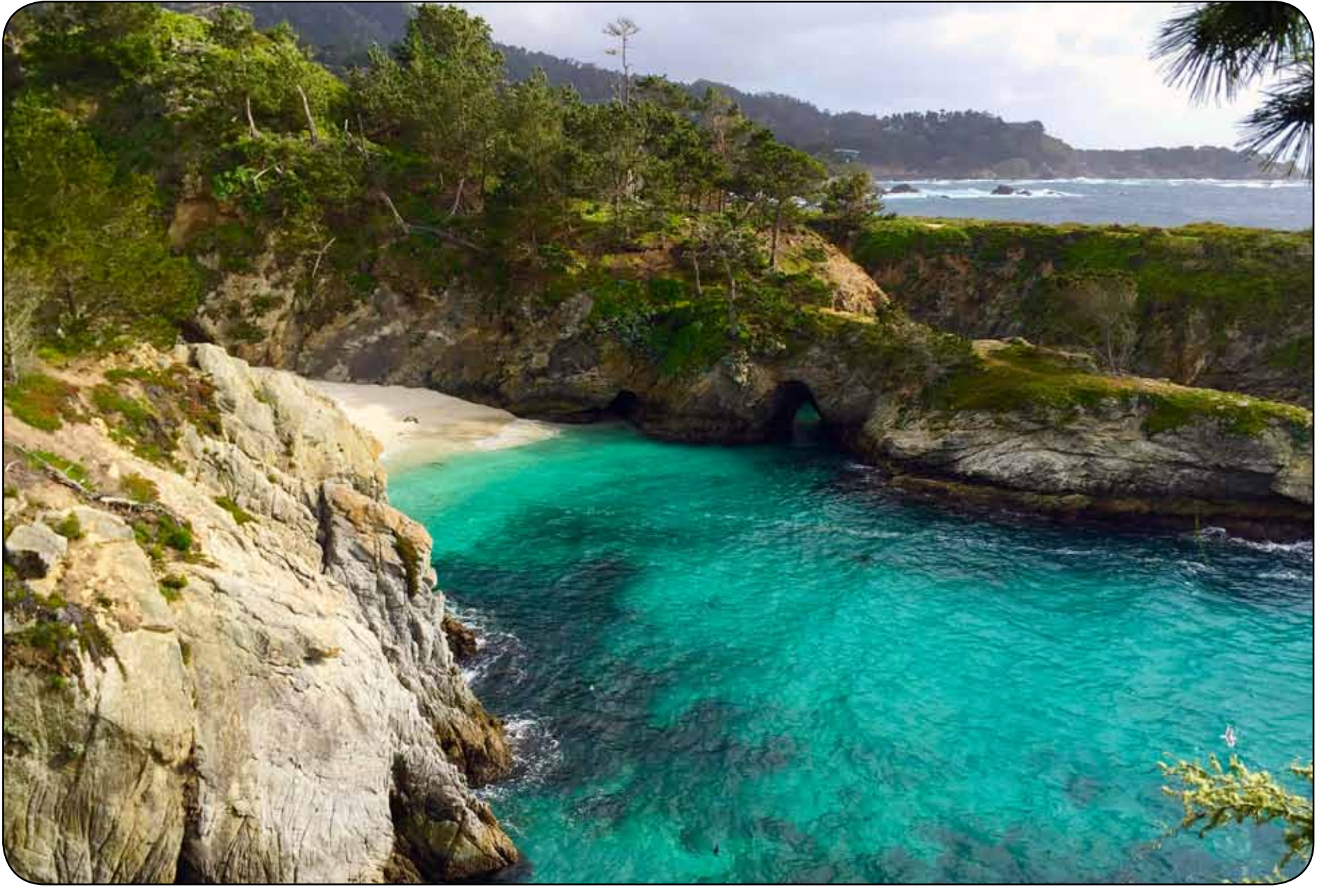
China Cove at Point Lobos State Natural Reserve