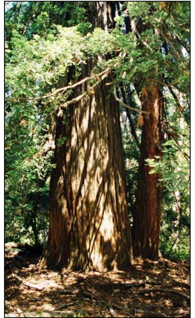
1,100 year old Colonial Redwood tree in Pfeiffer Big Sur State State Park