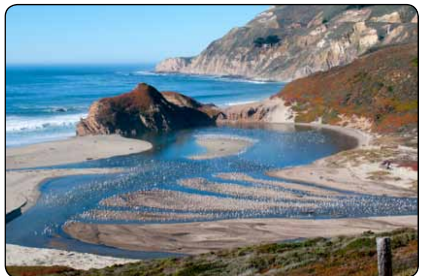
Little Sur Rivermouth