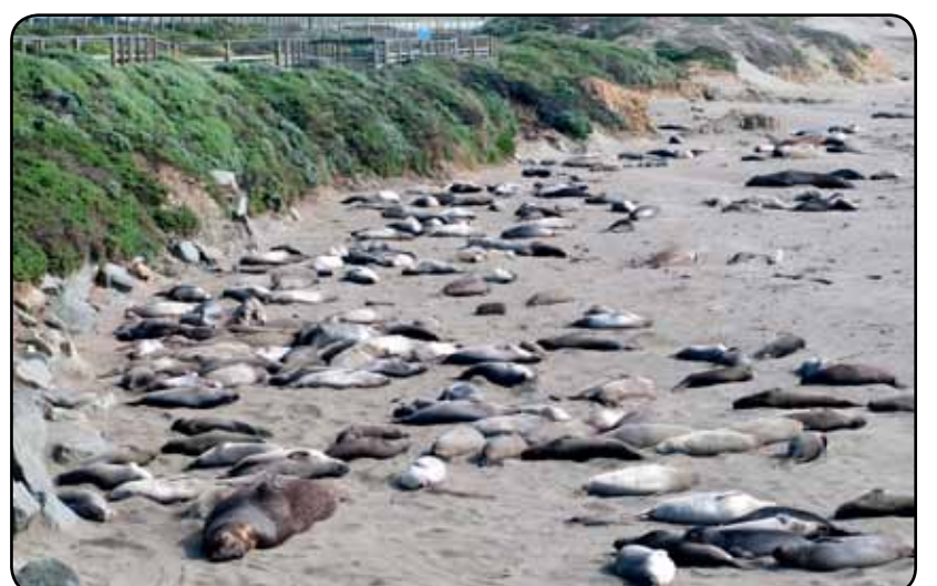
Elephant Seal Rookery with observation platform near San Simeon