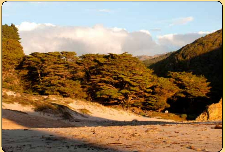
Pfeiffer Beach