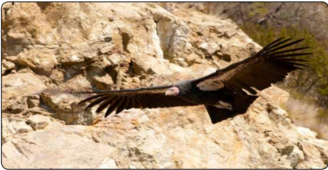
Rare California Condor soaring along cliffsides (9.5 ft wingspan)